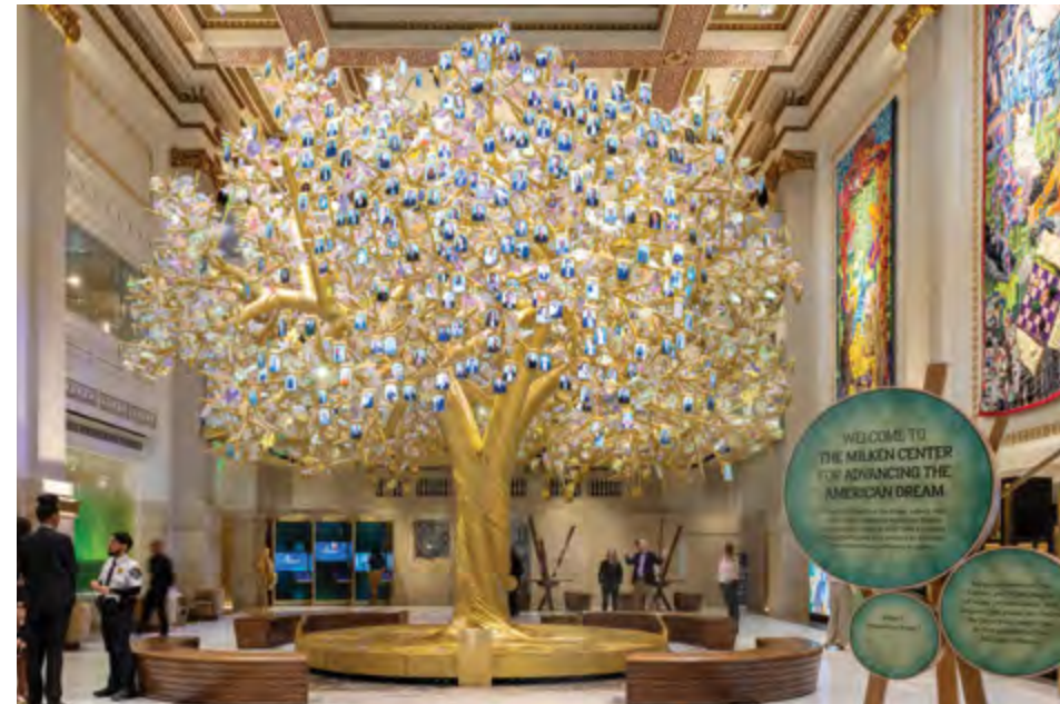
The Hall of Generations provides a stunning first impression of the American Dream Experience exhibition. The three-story-tall Tree of Generations allows visitors to upload photos that represent what the American Dream means to them.