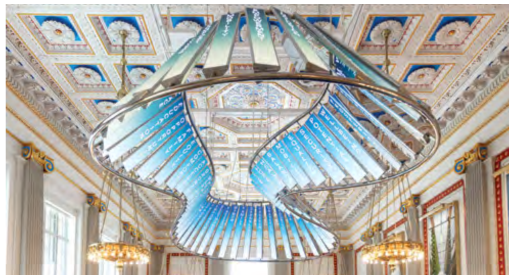
Filled with a 44-foot-long data wall, commissioned artwork, and quotes about the American Dream, the Hall of Dreams is the perfect place to seek inspiration and knowledge. Visitors can submit their own word that defines their own aspirations to the Word Cloud and watch it appear in real time.

An exciting feature at MCAAD, in the Education and the Educator space on the fifth floor, is the Roadmap to Achieving Your American Dream. The Roadmap has two common threads: first, in every endeavor people—human capital—make the difference. Second, education in many forms is the foundation toward reaching our goals. The exhibit includes over 50 display panels organized into six interconnected themes. These themes explore the powerful relationship between human potential and education through compelling stories, examples of successful education initiatives, videos, photos, quotes, activities and data. Visitors are challenged to reflect as they experience the Roadmap and think about actions they can take to change the world around them.