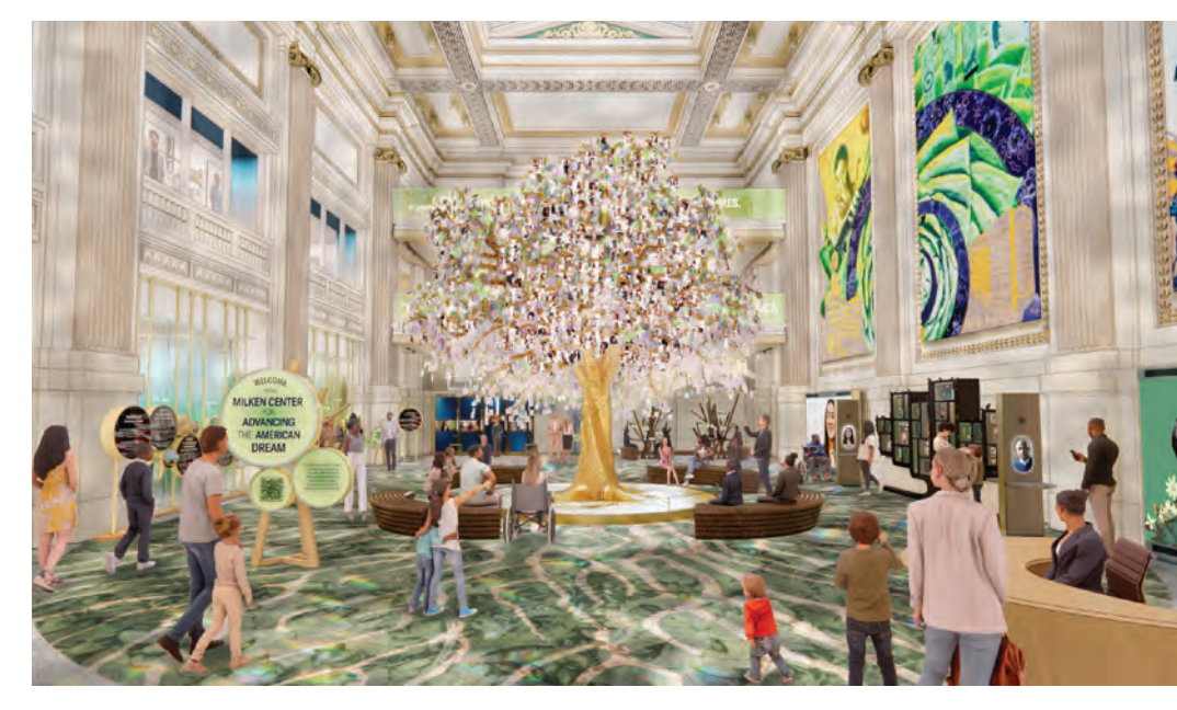
MCAAD's 'Hall of Generations' is the first space visitors will walk into a soaring welcome, featuring stories of how the American Dream is shaped by generations past, present and future.

The highly anticipated 2025 grand opening of the visitor center on Pennsylvania Avenue in Washington, D.C., will feature immersive exhibits, moving stories, contests and more aimed to inspire people to pursue their dreams.